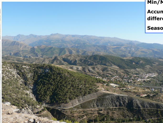
Far left: Civil War trench. Left: View from the trenches

D ISCLAIMER: While we have made every effort to ensure that this information is accurate, conditions can change, and you are responsible for your own safety.